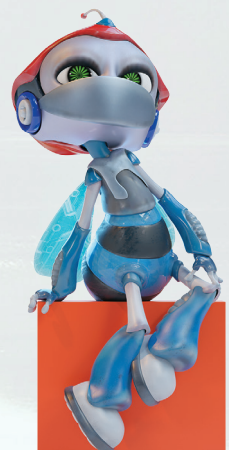
E-Bee MMU Mascot

This is an AR marker. Scan the MMU mascot to watch the video or view 360 video.