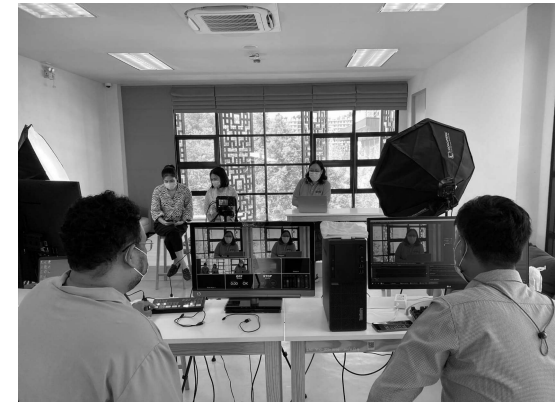
International Virtual Webinar