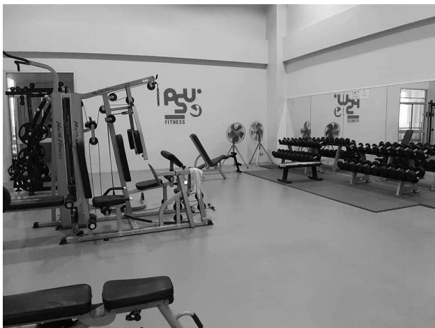
Fitness & Gym