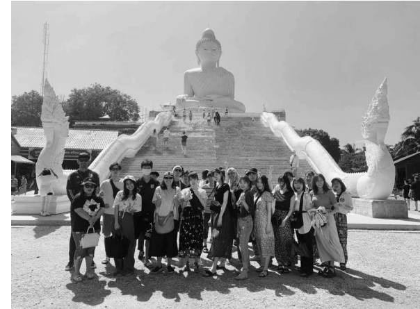
Phuket Big Buddha