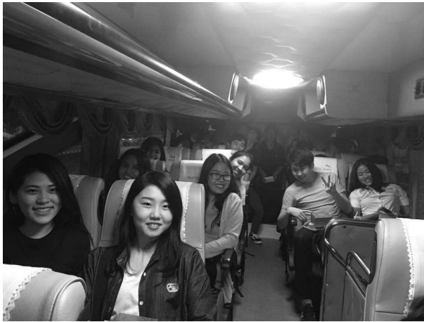
Airport Pick Up