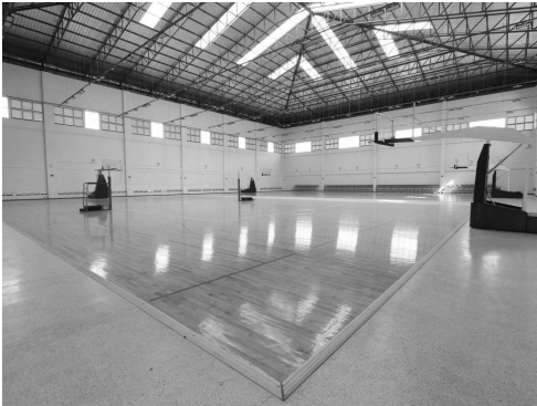
Basketball and Volleyball Court