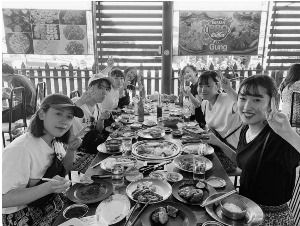
Enjoy Local food